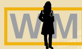
Exhibit Rules & Regulations

The parties agree to abide by the ACCME Standards for Appropriate Management of Associated Commercial Promotion: